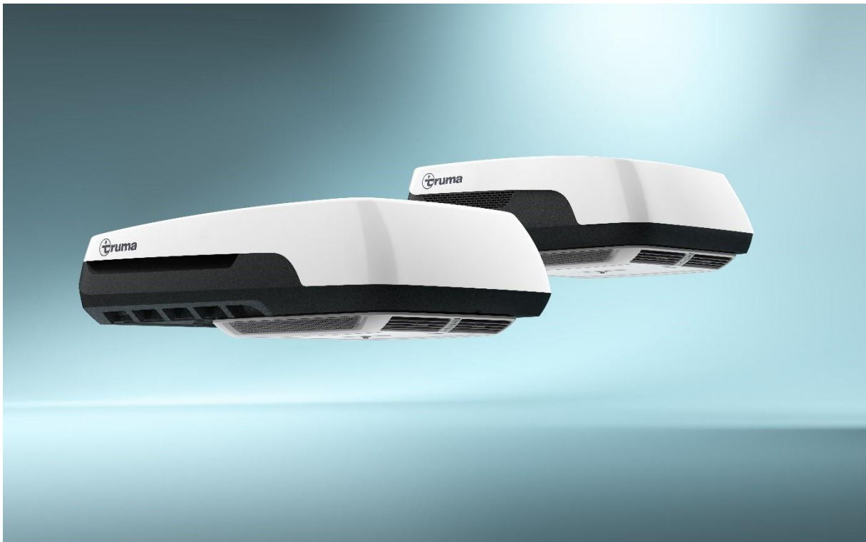
BU: Aventa 2nd Generation – A masterpiece of coolness (left: Aventa comfort 2nd Generation, right: Aventa compact 2nd Generation)

The Aventa series of roof-mounted air conditioning systems from Truma are some of the most popular air conditioning systems for motorhome owners and panel van fans. After all, they provide the perfect feel-good temperature in the vehicle at all times and have proven flexible, economical and efficient for everyday travel since their market launch. Now we present the true masterpiece of coolness with our 2nd generation of Aventa models – available from specialist retailers from spring 2025.